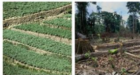
Raised field (top), Terrace (left), Slash and burn (right)