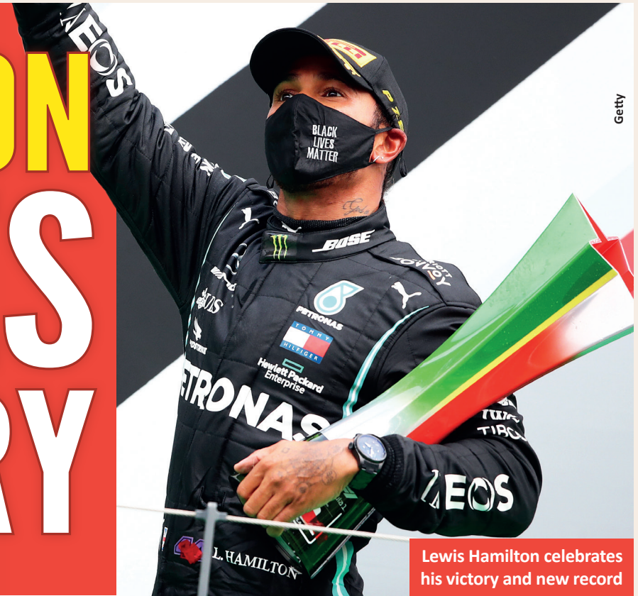
Lewis Hamilton celebrates his victory and new record