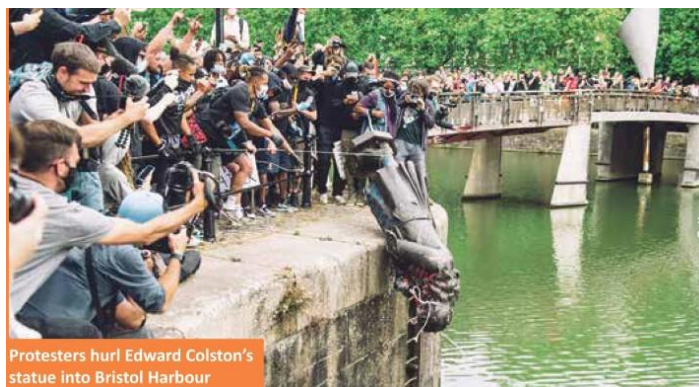
Protesters hurl Edward Colston's statue into Bristol Harbour