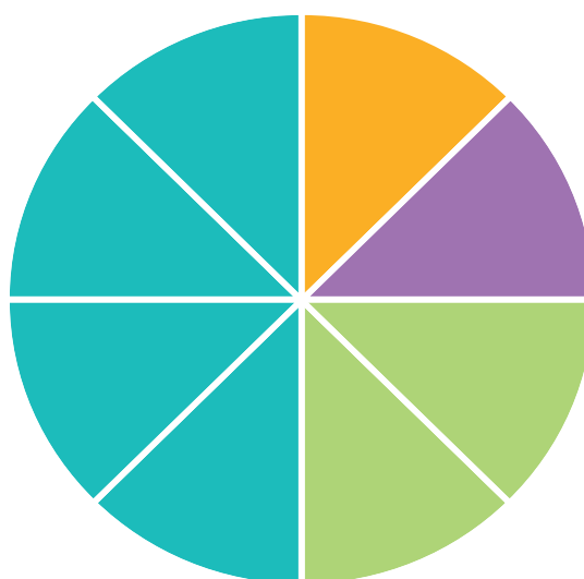
Favourite School Subjects

d) 25 children from year 5 and 17 children from year 6 chose art as their favourite subject.