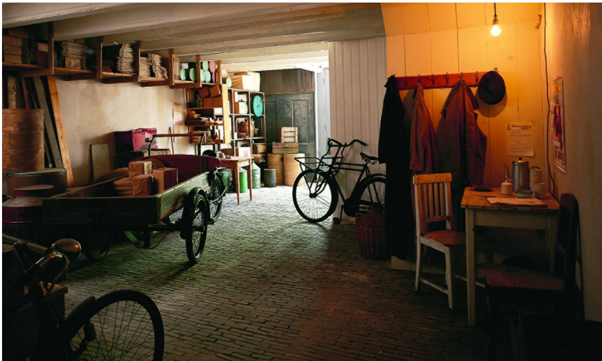
Reconstruction of the front storeroom, 1999.

At 9:00 am, the helpers started working in the office above the warehouse. The people in hiding walked around in socks and still had to be quiet, but sounds from above now caused less suspicion. The rest of the morning was devoted to reading, studying, and preparing for their lunch break.