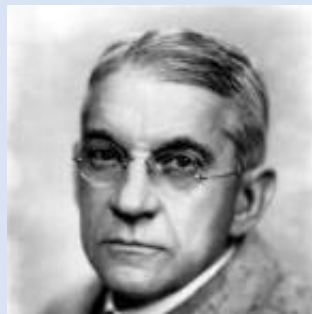
William Lyon Phelps