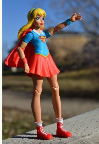
Supergirl - well known for her super strength and super speed had beaten Superman to the action.