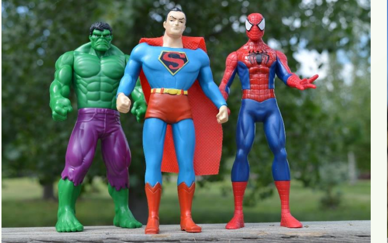
Ready for action, Superman (wearing his trademark red cape) called his friends to join him in the fight against evil.

Write sentences about these pictures where you add a parenthesis: