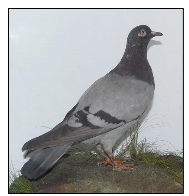
The King of Rome – in Derby museum.

In the West End of Derby lives a working man. He says, "I can't fly but me pigeons can." "And when I set them free It's just like part of me Gets lifted up on shining wings."